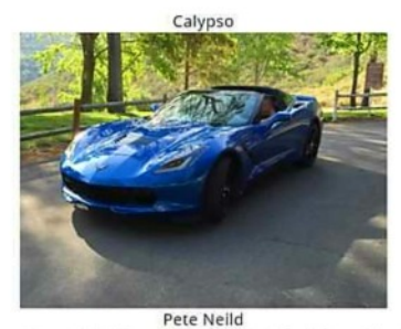
Calypso is my third Corvette and first R8C delivery. She is my everyday driver and has completed three cross-country trips, been on six tracks from Watkins Glen to Laguna Seca. She has participated in over a dozen car shows winning twice. You can learn lots more about her on her web-site. https://www.calypso-c74pin.com/

2019 Corvette ZR1 My ZR1 was a Christmas present from Santa (my husband). He new I wanted to add one to my collection but couldn't find one really I liked. So one day we were on our way to his doctor appointment when we happened to stop by a dealership and as we pulled in, there was this amazing Long Beach Red Metallic Tintcoat ZR1 just sitting there with this big red bow on top. He looked at me and said "go see if you like it? The rest is history...I drove it home and parked it next to my ZR1 SC757 and my GS SC606. My garage is finally complete! My license plate reads "REDS F35" and this bad boy lives up to the F35 LIGHTNING II's incredible passion for speed and stealth presence